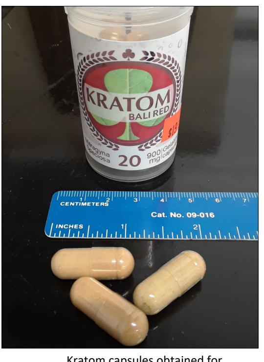
Kratom capsules obtained for laboratory testing.

UMMC Analytical Toxicology Lab (601) 984-1614